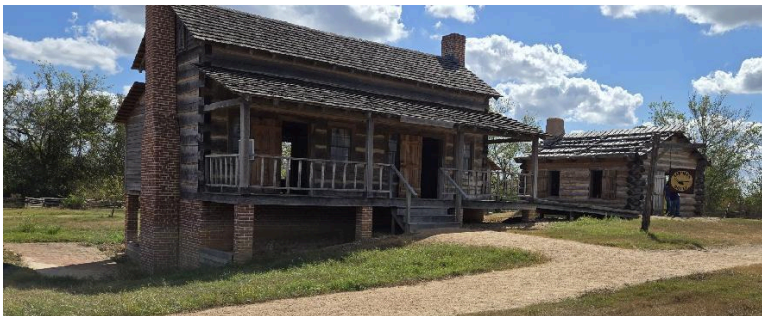
Building reproductions from Revolution-era San Felipe de Austin